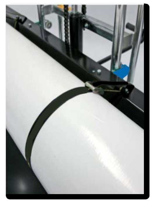
Material fixing straps to maximize media security during transportation.