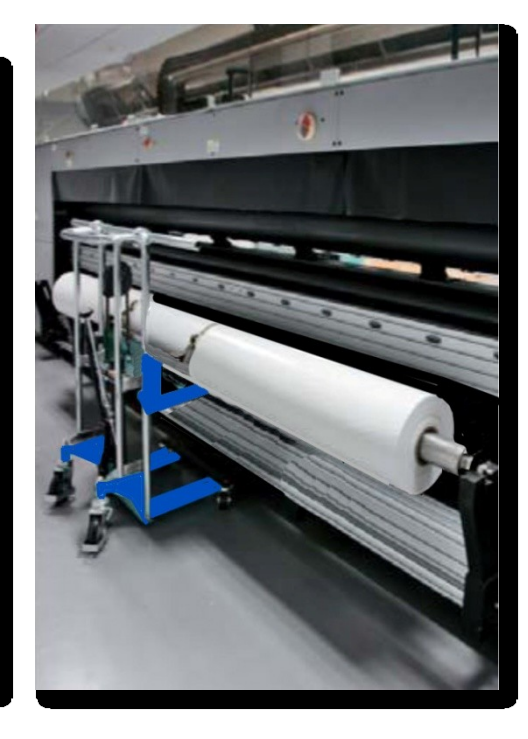
Easily lift and load media safely into the Printer.

Extended arms prevents the roll to curve on ends and avoid deformation