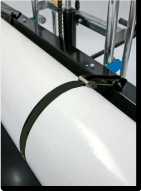
Material fixing straps to maximize media security during transportation.

ML320 for media rolls up to 5meter wide, weight 200 Kg.