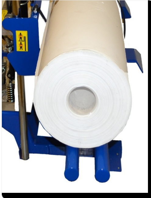
Extended arms prevents the roll to curve on ends and avoid deformation